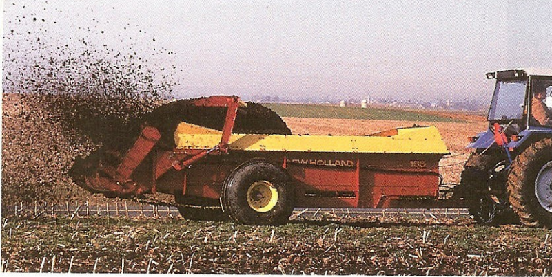
Flail units were developed to apply products with a higher solids content in a narrow strip.

es over large open turf areas. The unit is extremely versatile, having the ability to apply one sixty-fourth to a three inch layer of various materials. The unit is primarily used for golf course and athletic field applications and may be fitted with a finishing brush to break up product clumps and project the material more uniformly onto the soil surface.