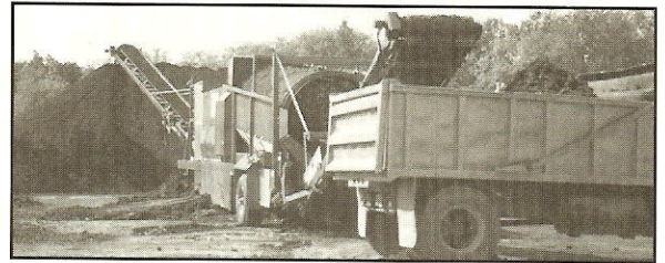
Pivoting Conveyor allows greater stockpiling capacity and truck loading of fine and reject material.

Let Us Eliminate All Your Screening Problems.